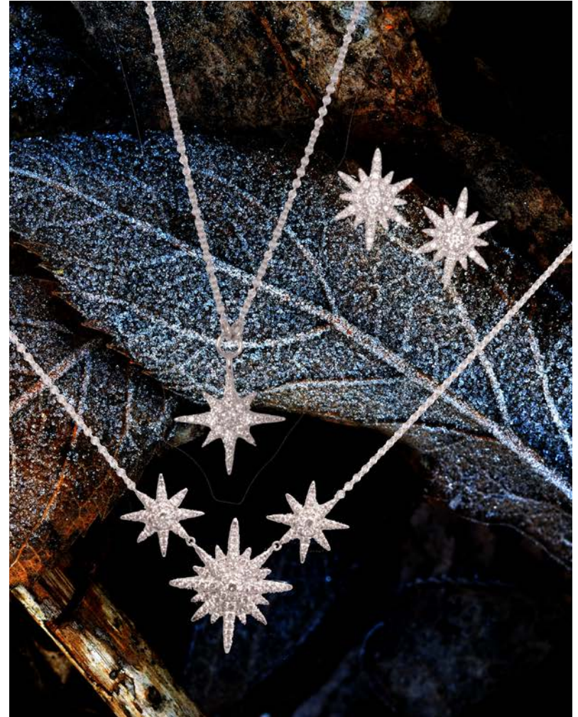
14k white gold diamond star collection: Single pendant $765, triple star pendant $1,585, starburst earrings $995