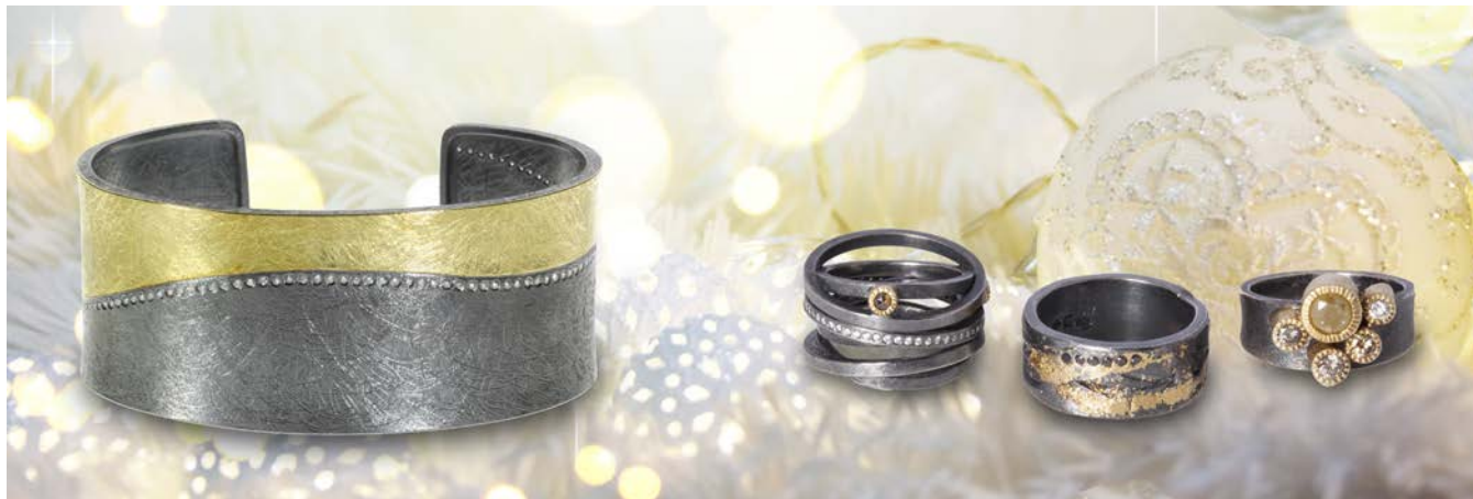
18k yellow gold, oxidized sterling silver and diamond collection, starting at $2,450