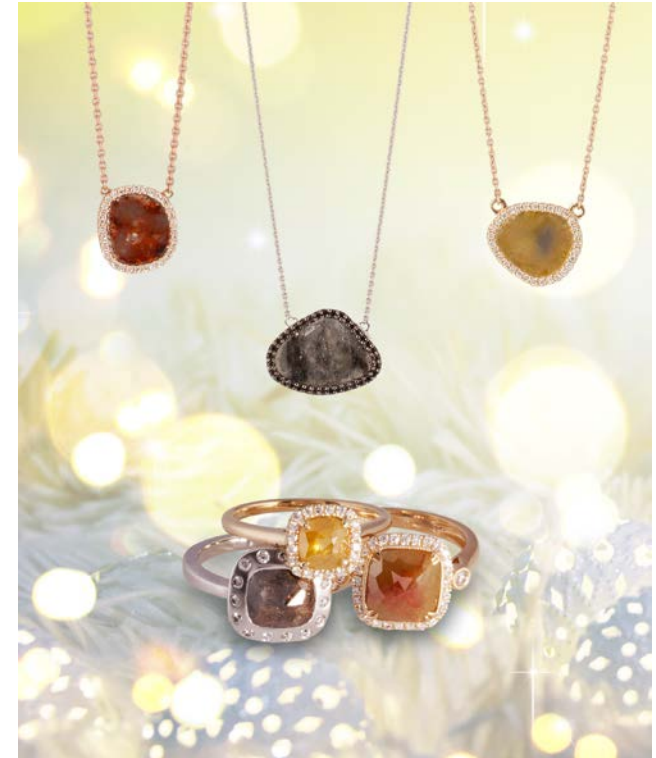
Diamond slice pendant collection starting at $1,650 and rose cut natural color diamond ring collection starting at $1,575

Pictured on front cover: Stacking ring collection in 14k and 18k gold with gemstones and diamonds, starting at $465